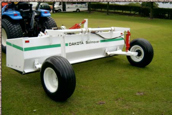
Non-Ripper Models 8' 10' 12' 14' 16'