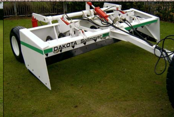
Ripper Models 6' 8' 10'