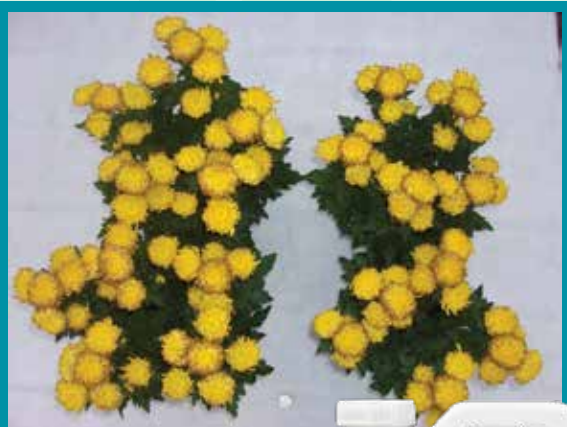
With vs. Without

University and in-field tests have shown REV to improve plant size, flower mass, and color vibrancy.