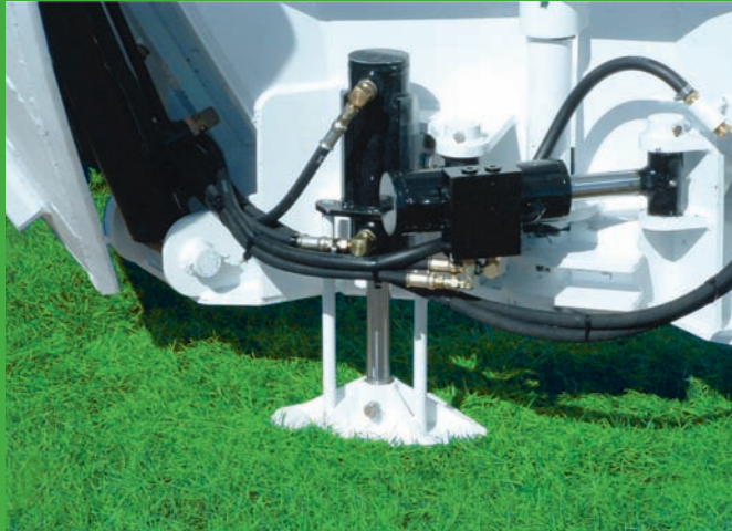
Outside Gate Cylinders

A lot of good tree spades are on the market today, but the DAKOTA Model 65 Tree Transplanter makes them all obsolete. The 65 is faster, built stronger and requires less maintenance than the rest.