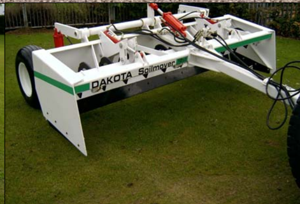
Ripper Models 6' 8' 10'