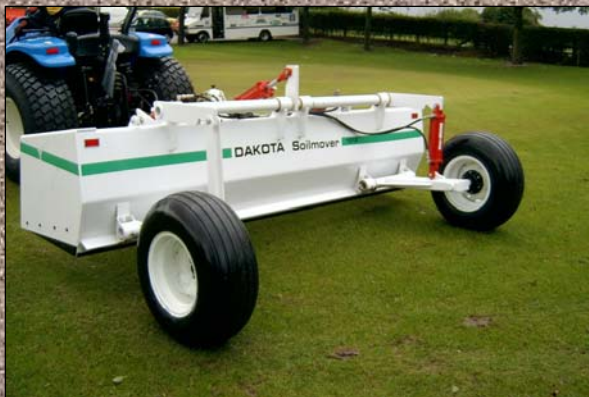
Non-Ripper Models 8' 10' 12' 14' 16'